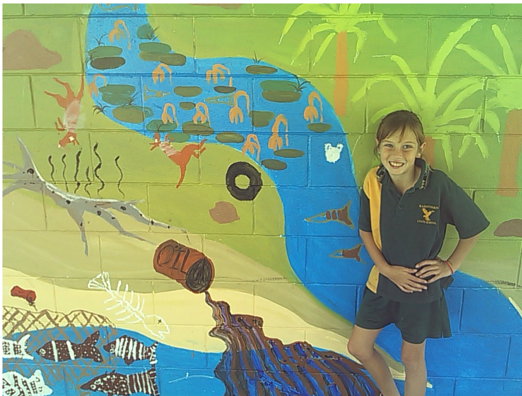
Figure 4-2 Rasmussen State School Mural