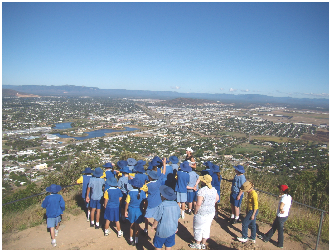
Figure 2-1 One of the Interpretive Sites on the Catchment Tours