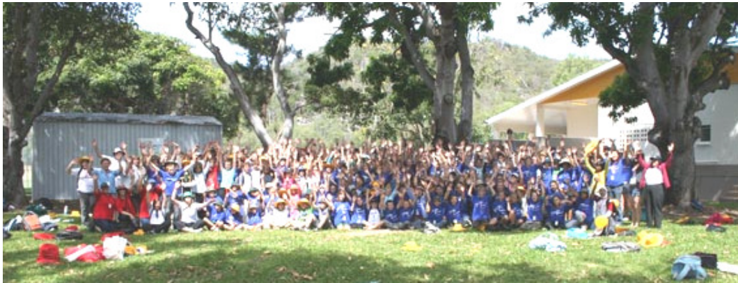
Figure 4-1 All Together at the Youth Coastal Conference

The students also took part in a day of environmental activities on Magnetic Island. Nine sites were prepared and students were able to undertake hands on learning activities such as constructing gross pollutant traps, surveying coastal vegetation, testing water quality and sampling macro-invertebrates.