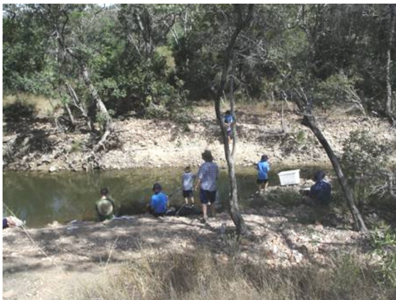
Figure 3-1 Macroinvertebrate Monitoring at Sachs Creek

Note: Stuart State Primary School students enjoy some macro-invertebrate monitoring at Sachs Creek